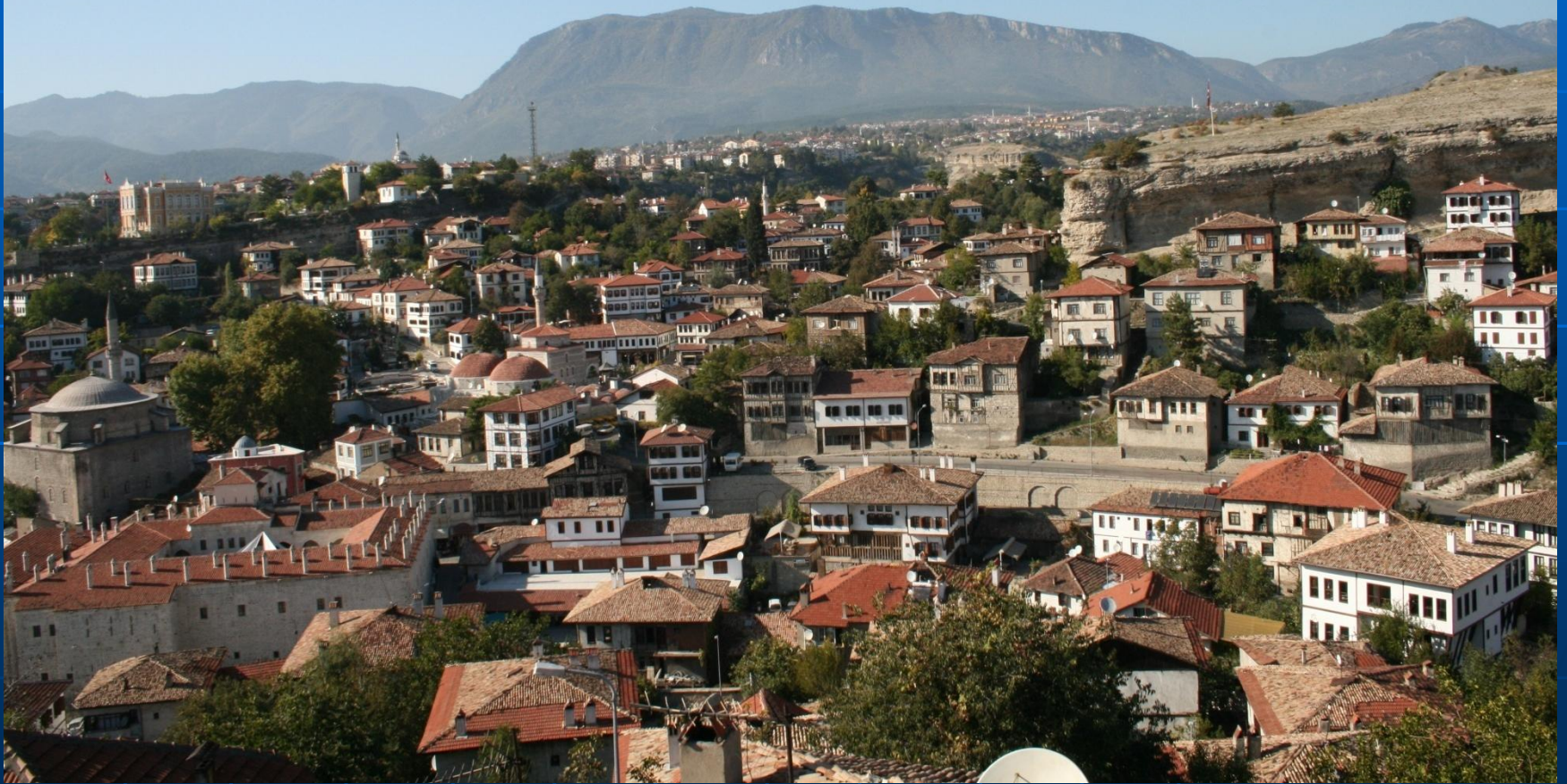
Safranbolu (Ancient Settlement)