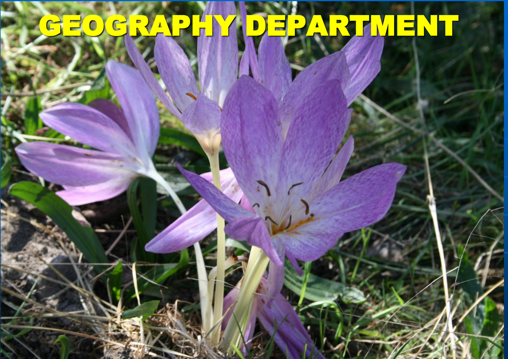
A flower which is grown near the Safranbolu( Crocus sativus )