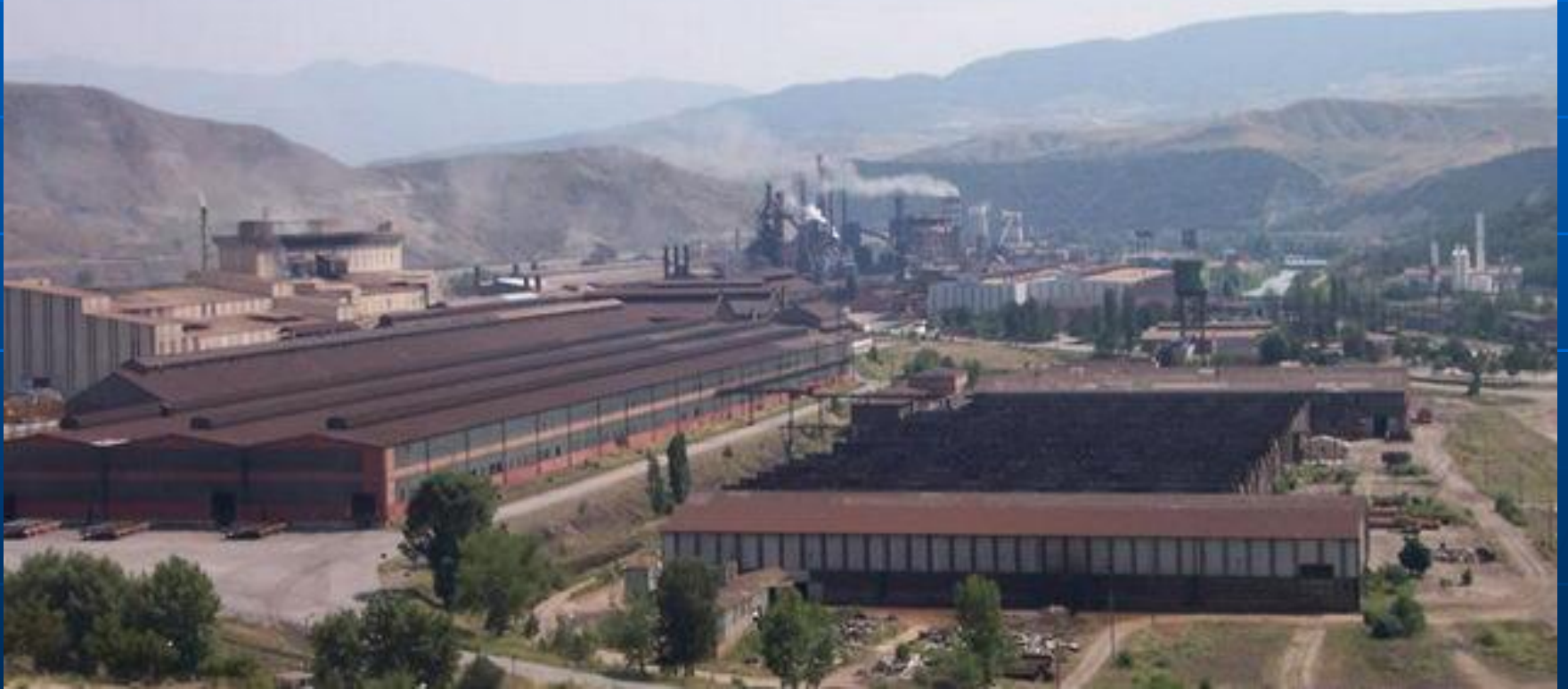
Kardemir Iron and Steel Factory-Karabük