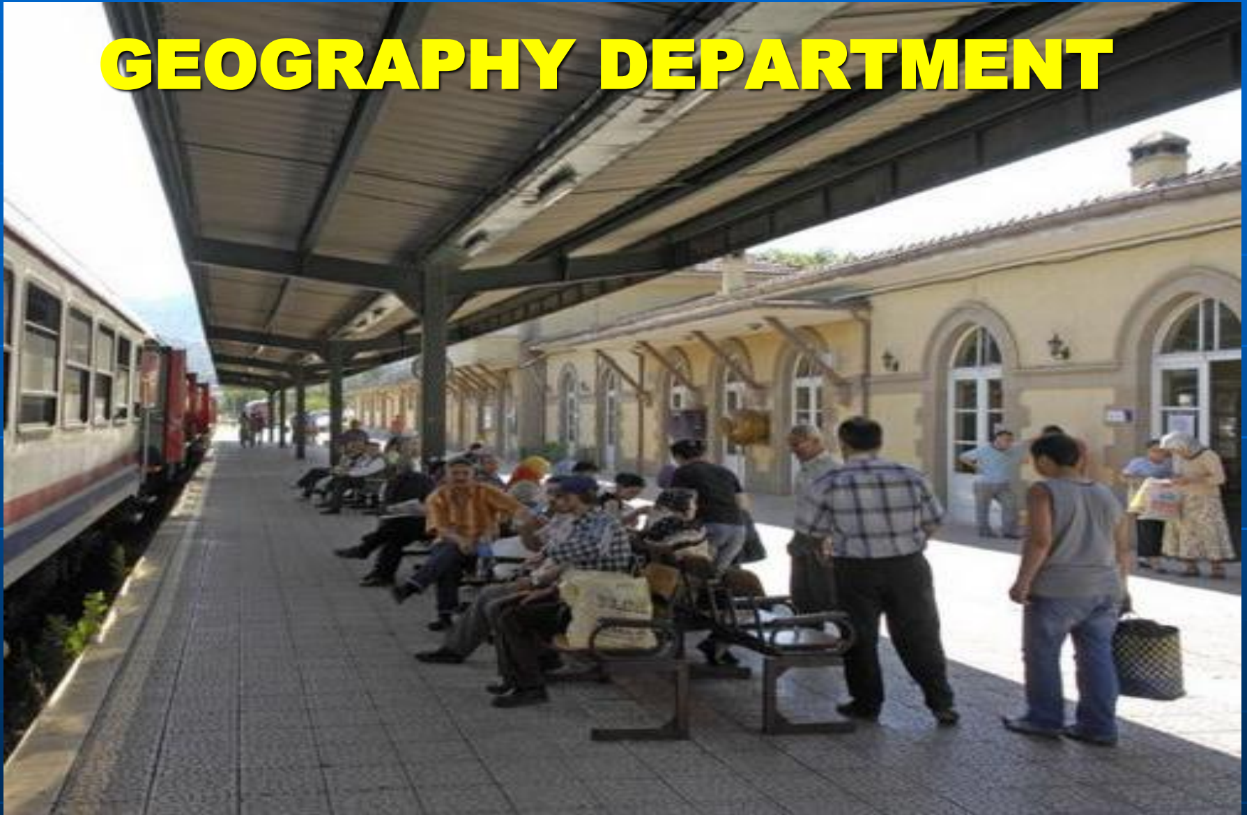
Karabük Train Station